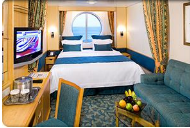
Ocean View Stateroom