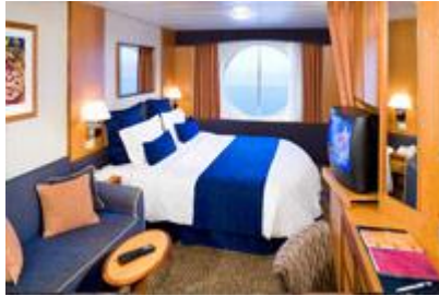
Ocean view cabin $5,495

per person double occupancy sharing an Inside cabin