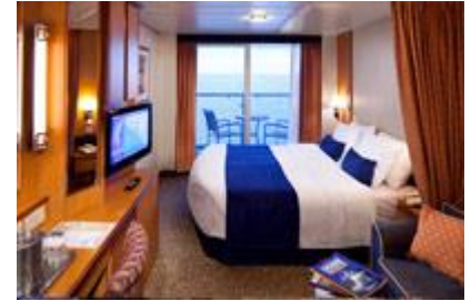
Ocean view private balcony $5,995

per person double occupancy sharing an Ocean View Cabin