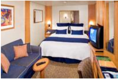
Inside cabin $5,295

per person double occupancy sharing an Inside cabin