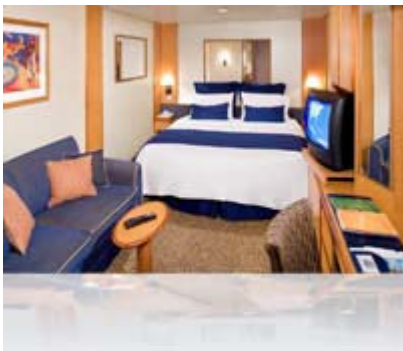
Inside cabin $2,795

per person double occupancy sharing an Inside cabin