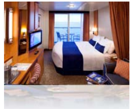
Ocean view private balcony $3,595

per person double occupancy Sharing an Ocean View Cabin